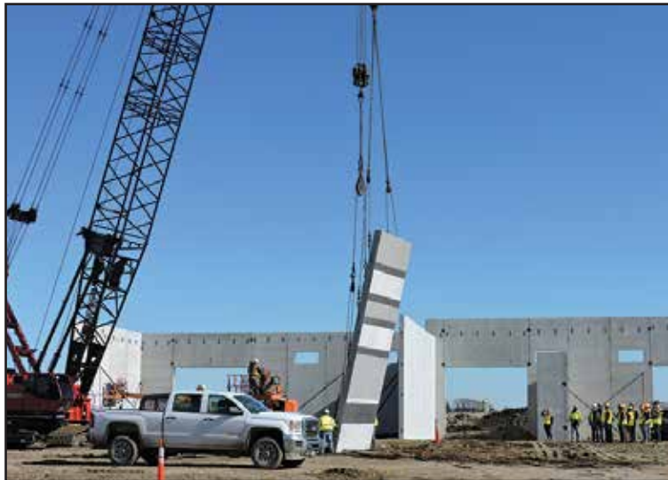
Students watch as a 32 foot precast concrete panel is tipped up and prepared for installation at the site of McLeod Co-op Power's new facility.

The group observed as precast concrete panels were delivered and installed on October 25. See page 2 for more photos and an update from General Manager Carrie Buckley.