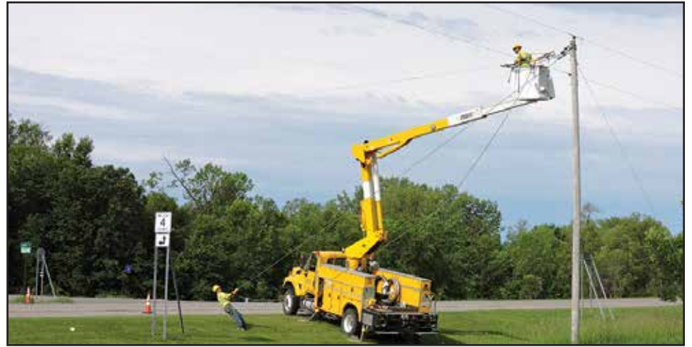
Co-op linemen worked quickly to put lines back up after the shed moved through.

The move required McLeod Co-op Power, Xcel Energy, and Hutchinson Municipal Utilities to drop many power lines and put them back up again. Affected members were notified in advance by telephone. McLeod Co-op Power line crews worked all day on the shed move. All costs for labor, vehicles, and logistics planning related to the building move are paid for by the moving company, not Co-op members.