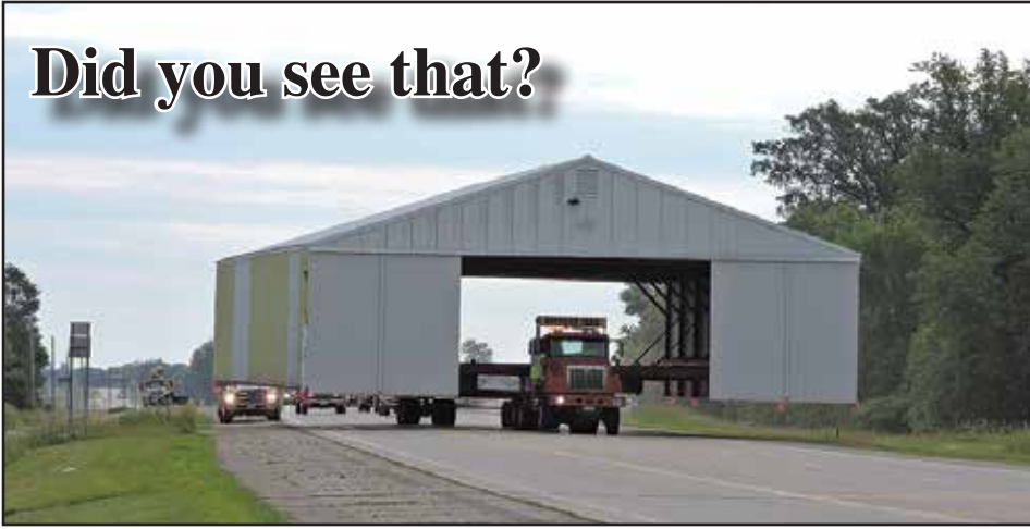
A metal building measuring approximately 55 feet by 200 feet was moved down the middle of Highway 7 east of Hutchinson.

It is not every day that you see a large machine shed moving on Highway 7. This particular shed was moved on June 20th from west of Silver Lake to west of Hutchinson, however it had to take a long and winding detour around the south of Hutchinson and then back north to Highway 7 to avoid stoplights, bridges, and other obstacles. It was the cause of members along the route being out of power for a period of time on that Thursday.