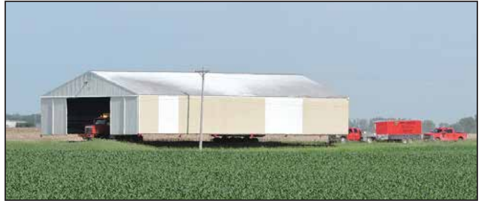
The machine shed travelled south along Nickel Avenue, east of Hutchinson.