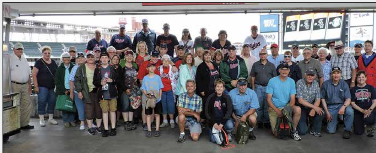
Fifty-three members and employees attended the June 27 MN Twins game. They traveled via fan bus to Target Field and watched the 18-inning game where the Tampa Bay Rays beat the Twins.

What Can You Do With $1 Worth of Electricity?