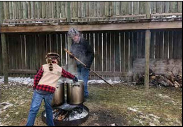
Cooking pots of stew over fire.