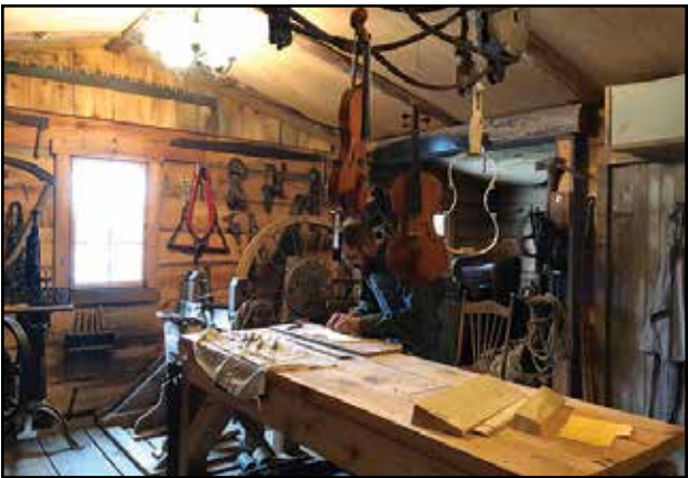
The art of violin making.

The Stockade has 13 buildings, from a general store to a gunsmith;