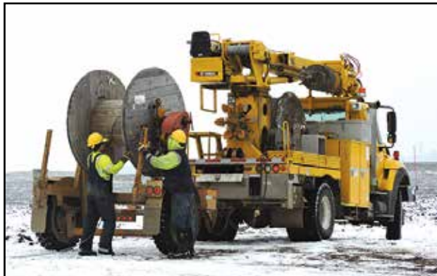
Linemen preparing to roll up old conductors being retired onto reel on the BE-5 job near Lake Marion in McLeod County.

M CPA line crews wrapped up two work plan projects the last week of December. HE-3, a three-mile road job that is south of Hector, from Renville County Road 16 east to a mile east of State Highway 4, converted a three-phase overhead line to underground conductors. The remaining line and poles were removed the end of December.