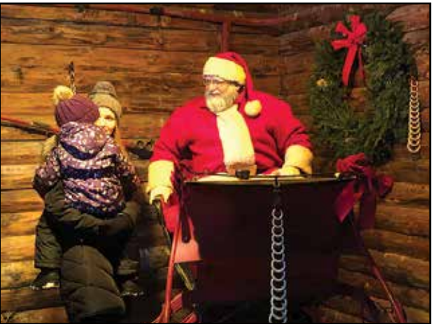
Shy little one meets Santa.

from a newspaper office to a pottery and candle shop and school house, just to name a few. Each building has been researched and built by hand as it would have been in 1862. Chuck Fuller is in charge of the research and buildings. Within each building you will find activities that would have been carried out then, just the way it would have been done all those years ago.