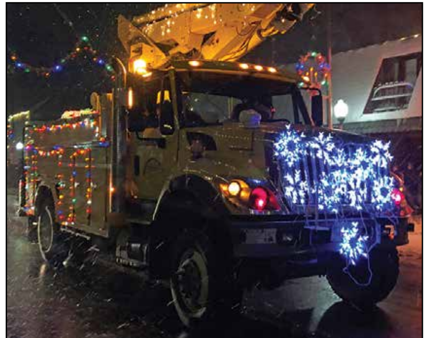
McLeod Co-op Power participated in Arlington's Arli-Dazzle lighted parade the evening of December 1. One of the MCPA line workers and his family volunteered to take the decorated bucket truck through the parade.

Mark your calendars for the Co-op's Annual Meeting. It is planned to be a morning meeting this year on Tuesday, April 9, at the Hutchinson Event Center.