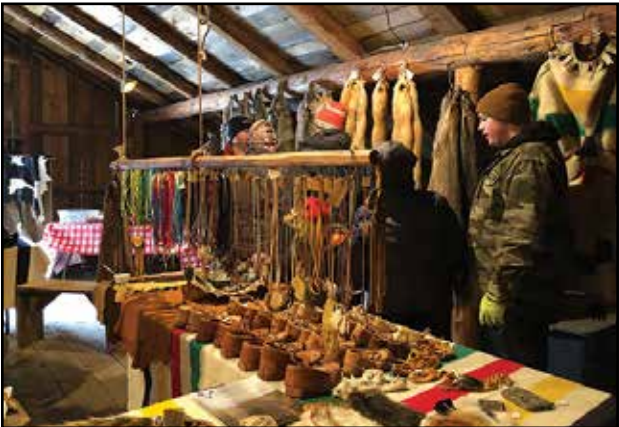
Fur pelts, moccasins, hats, and other items for sale.