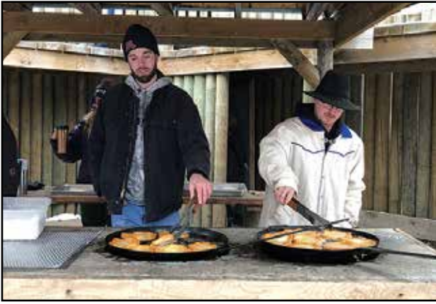
Volunteers making fry bread.

The Hermanns are proud of the fact that the Stockade is self-sufficient. There are no grants, county or state funds that they