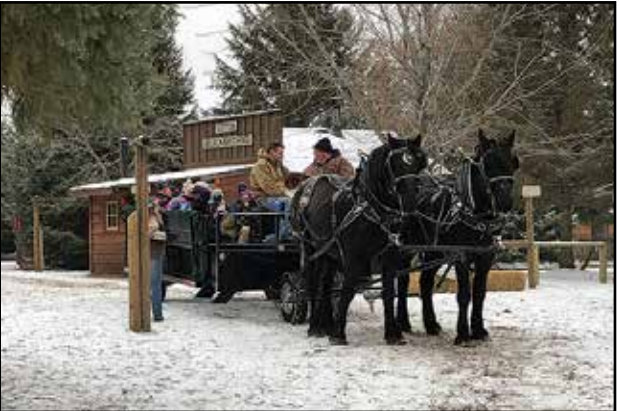
Horse rides around the grounds.