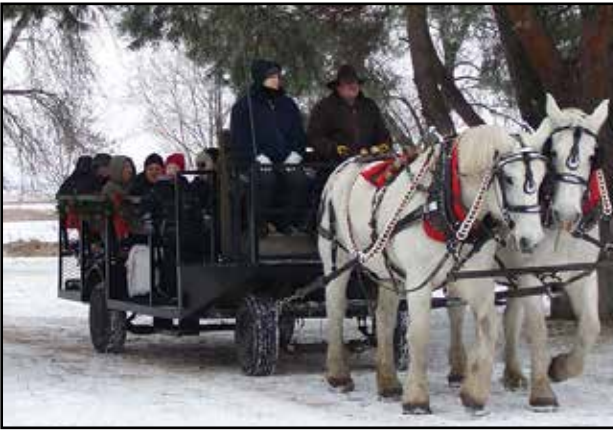
All ages enjoyed rides around the Stockade property.

For more information about the summer Rendezvous, the Pioneer Christmas, volunteering, donating and more, visit their website at forestcitystockade.org .