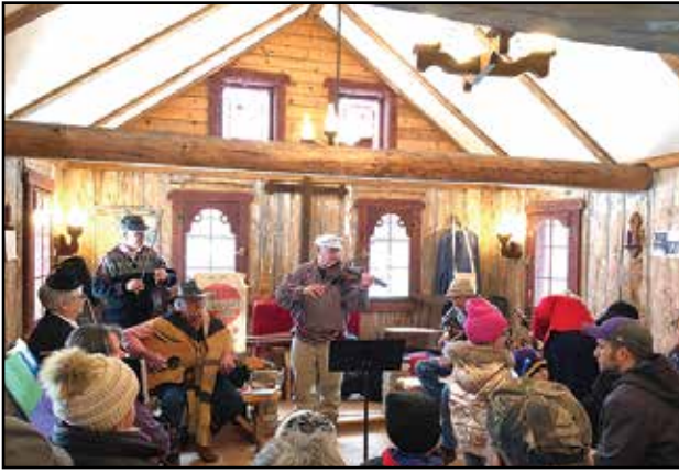
Fiddling holiday carols in the chapel.