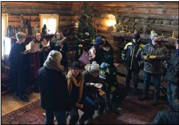
Carolers sing in the lodge.