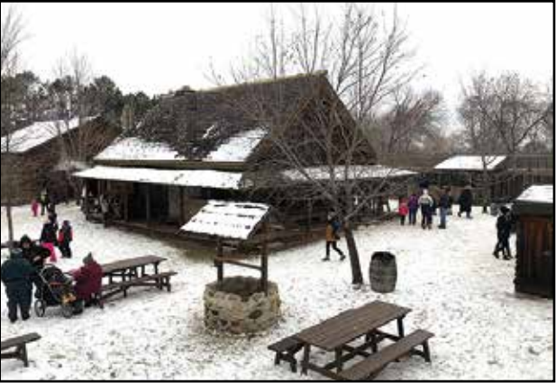
Interior of fort from restored upper walkway.

"The travel agent said these people wanted to experience what their ancestors experienced coming to Minnesota all those generations ago, and see how they must have struggled in their first years,"