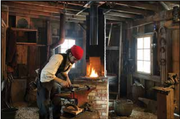
Blacksmith making a tool.