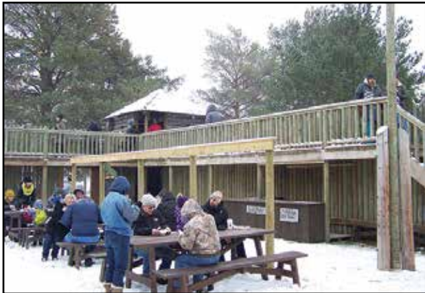
Visitors eating hot fare on a cold day.