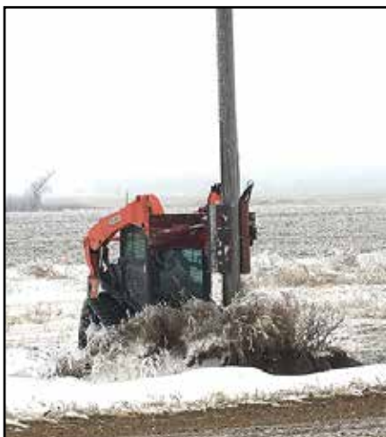
Crews removing poles south of Hector after completing the conversion of overhead to underground lines.

Cost is $250 per person for adults and $150 per person for children under 18 sharing a room with their parents or grandparents. Cost includes motor coach transportation, two nights in hotel with pool and amenities, and most meals. Call the Co-op to make your reservation or request a more detailed information packet.