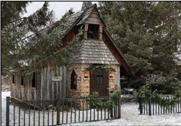
Chapel in the pines.

"Items in the general store are items you would have found in the