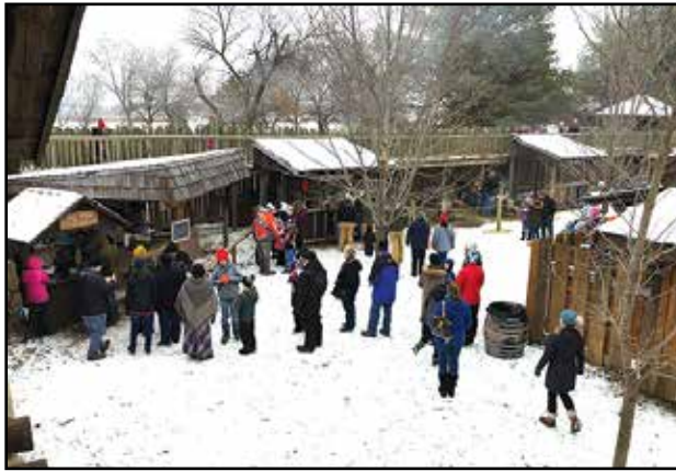
Line to purchase warm fry bread rolled in sugar and cinnamon.