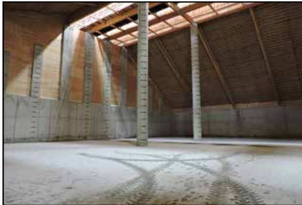
This potash bin was currently empty and awaiting product. The numbered walls and columns allow employees to calculate remaining inventory.

The new UFC plant can store 52,800 ton of dry product. That is significantly more than the 38,000 ton capacity at their Winthrop plant.