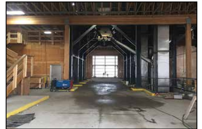
The load-out bay is beneath the mixer tower. Trucks pull into the bay to be loaded with dry fertilizer. The new automated system allows trucks to punch in their order number on a keypad while waiting in line to enter, so their order is ready to go when they get into the bay.

"We are helping all the local farmers even if they don't get product directly from UFC," said Schwab.