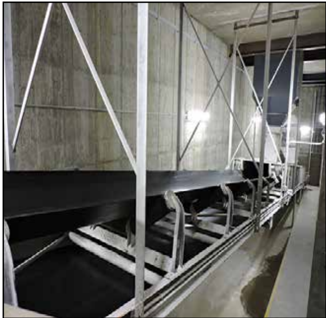
After a train car is unloaded, this conveyor transports up to 1200 tons of product per hour from 23 feet below ground up to the proper swing bin for storage. Old conveyors could only carry 50 tons per hour.

Planning for this plant had been in the works for 7-8 years. UFC spent years researching the region to determine how many acres could be served out of the plant and determining where it should be built. Actual construction has been going on for just over a year at the site west of Brownton on Hwy. 15.