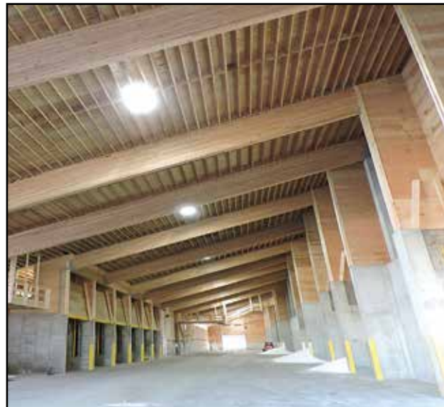
The entire facility utilizes LED high efficiency lighting. Sealed, waterproof 240 watt high bay overhead fixtures were used in this bin corridor. The LED fixtures qualified for an energy grant from the Cooperative.

More than 10,500 yards of concrete and 3.4 million pounds of rebar steel in the concrete was used to construct the dry fertilizer building. The Minnesota Dept. of Agriculture monitored every move of construction at the entire site to make sure it met Minnesota Pollution Control Agency requirements for things like water stops, double-piping, and dike containment. The staff at UFC said that they went farther than required to meet future specs and regulations, guaranteeing a very safe facility now and in the future. Regular training is also done with Brownton and other area fire departments at the plant.