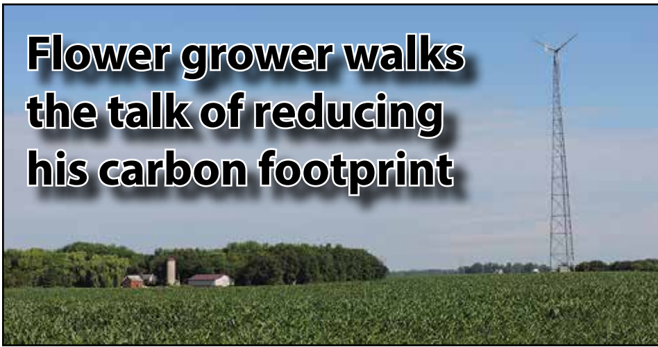
Al Huff has operated his Jacobs 20 kW wind turbine since 2006. It is located in a field near his home for the best wind availability.

The ultimate description of a Co-op member trying to reduce their carbon footprint would be someone who heats their home with a ground source heat pump and some passive solar, participates in the Co-op's water storage program, operates a wind generator, participates in the Co-op's community solar garden, drives an electric car, is a Wellspring wind subscriber, planted 30,000 trees for posterity, grows thousands of flowers and plants, and recycles everything possible. Alvin Huff fits that definition perfectly. He does all the things listed above and truly walks the talk when it comes to trying to reduce his carbon footprint.