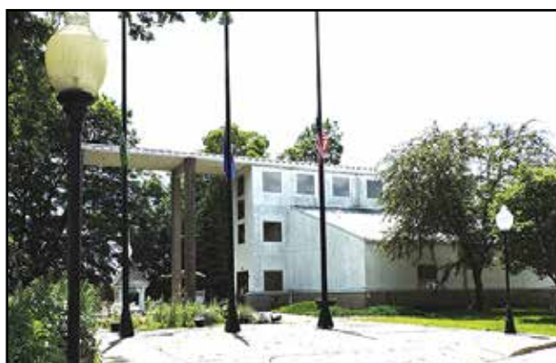
The Operation RoundUp funds were matched by larger grants and will be used for window, door and HVAC improvements.

The $2,000 donation the Co-op's Operation Round Up organization awarded to the McLeod County Historical Society & Museum was matched with another $2,000 in Burich grant funds. These funds helped the museum qualify for an additional grant from the Minnesota Heritage and Legacy Fund. It will all go towards a larger overall project of replacing windows and large inner and outer entry doors, and a new HVAC system in the facility to assure preservation of historical artifacts in the proper environment. The project improvements will provide greater energy efficiency in the building, improved temperature and humidity levels, and provide glass with proper UV protection to help preserve artifacts.