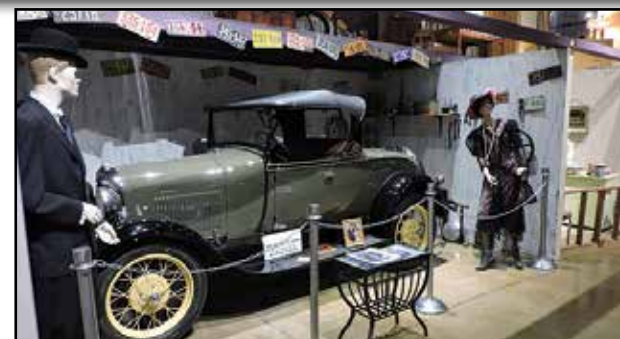
The McLeod County Historical Society and Museum includes many displays and exhibits like the one shown above. At this time they are featuring a special exhibit on fire departments, antique equipment and gear, and historical fires of McLeod County.

Two recipients of Operation Round Up funds in 2016 were the McLeod County Historical Society & Museum and the McLeod County Emergency Food Shelf. Funds come from members who round up their electric bills to the nearest whole dollar amount and give the change to Operation RoundUp, as well as sources of matching funds, MCPA employee contributions, and other donations MCPA receives for the fund.