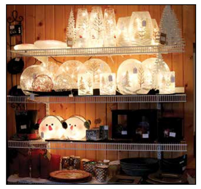
The gift shop offers Christmas items of all kinds, as well as handmade wreaths, cookies, cider and cut trees to choose from.

they can't really fly, but they know how to throw their head back and prance and jump so that they look like they're ready to take off. It's fun to watch them."