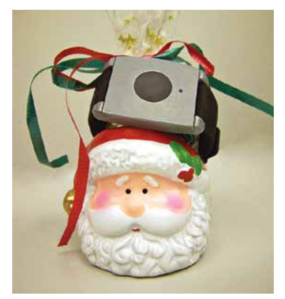
A First Alert pendant makes a great Christmas gift for mom or dad. It gives them greater independence and you will worry less about them living alone.

irst Call gives you and your loved ones the peace of mind that help is available any time of day, any day of the year. McLeod Co-op Power members and non-members alike who have health or mobility limitations or simply live alone, can subscribe to the Co-op's First Call program. With a simple push of a pendant worn around the neck or wrist, help is summoned day or night. For a low monthly cost of $30 and a one-time installation fee of $49 plus tax, you can get that peace of mind for yourself and your loved ones.